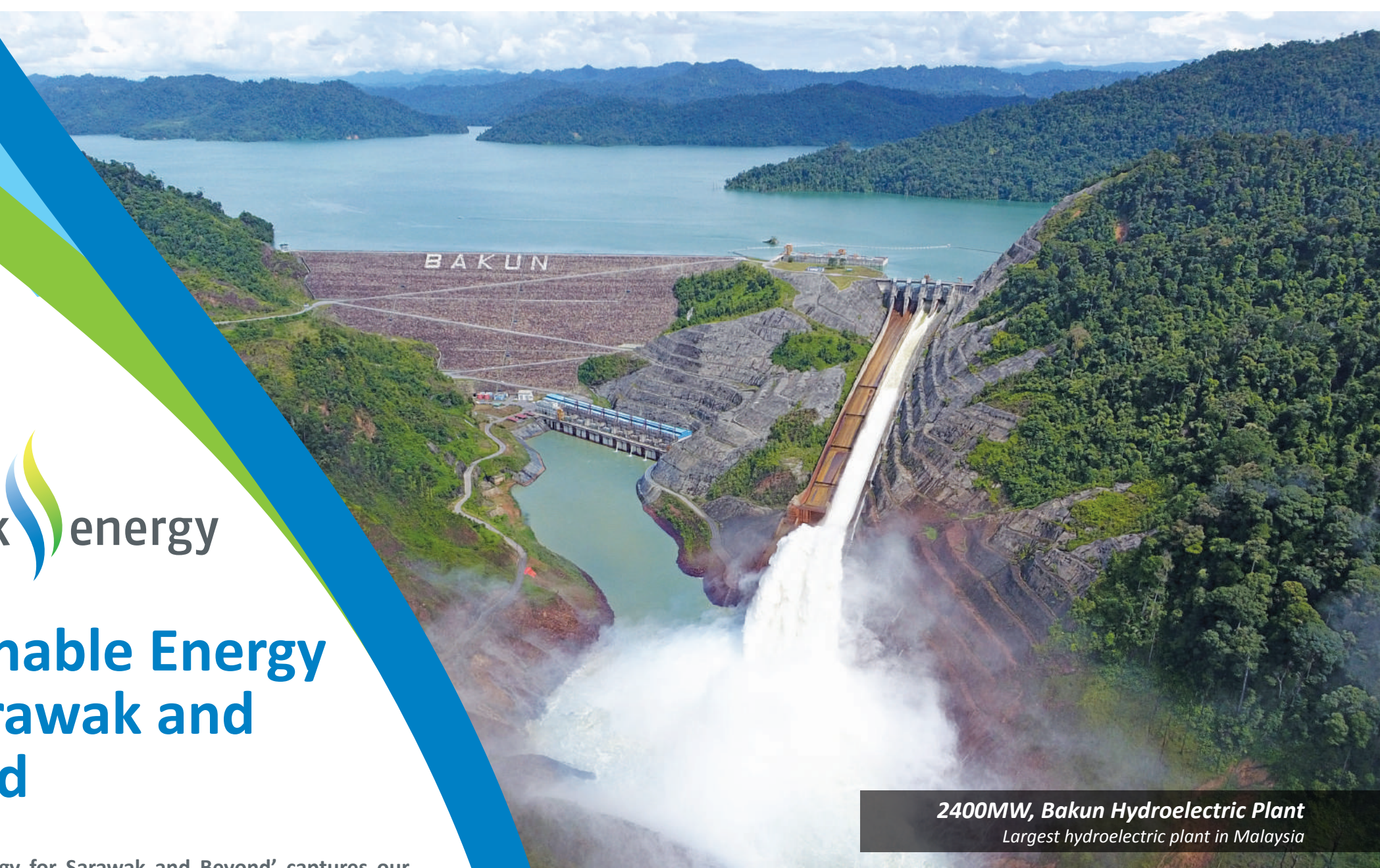
2400MW, Bakun Hydroelectric Plant Largest hydroelectric plant in Malaysia