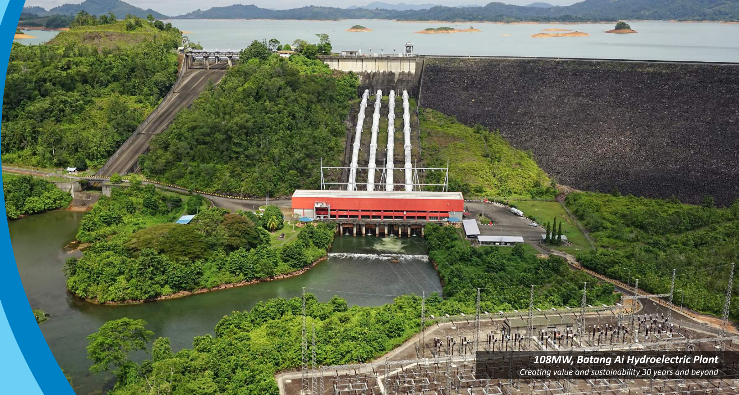
108MW, Batang Ai Hydroelectric Plant Creating value and sustainability 30 years and beyond