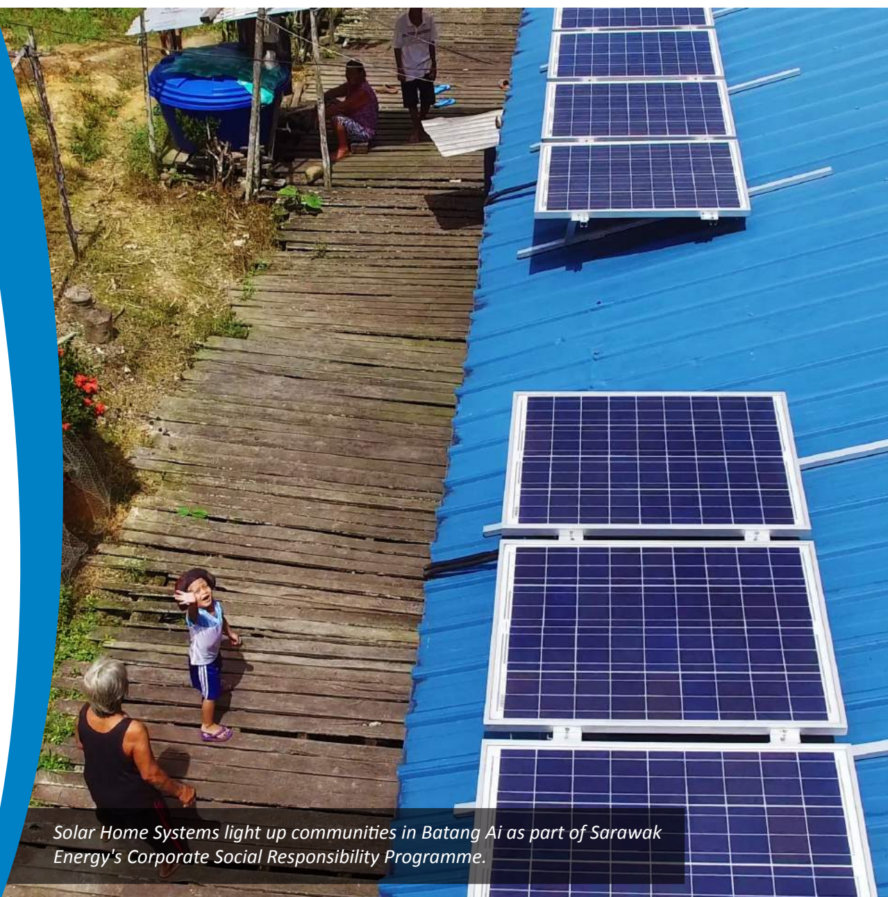
Solar Home Systems light up communities in Batang Ai as part of Sarawak Energy's Corporate Social Responsibility Programme.