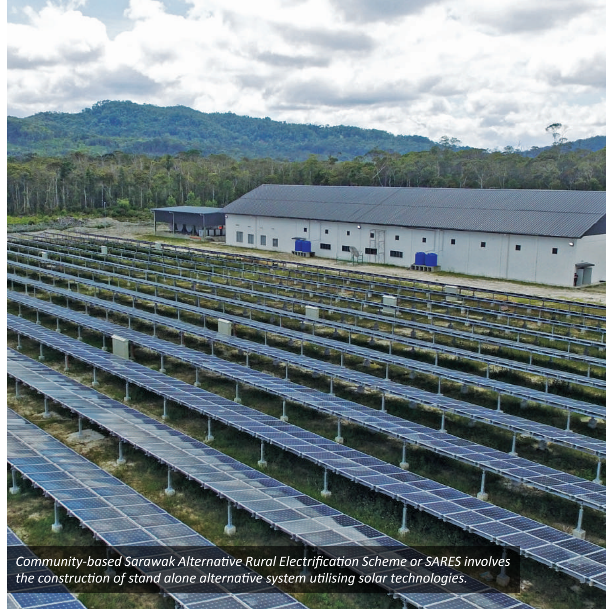
Community-based Sarawak Alternative Rural Electrification Scheme or SARES involves the construction of stand alone alternative system utilising solar technologies.